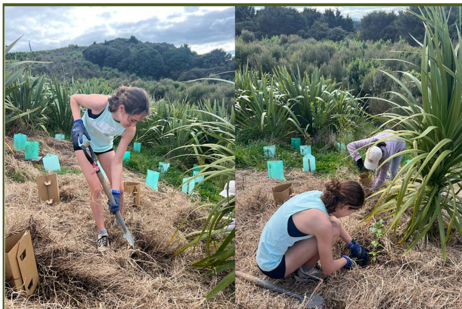
St. Kentigern College 27 August 2023