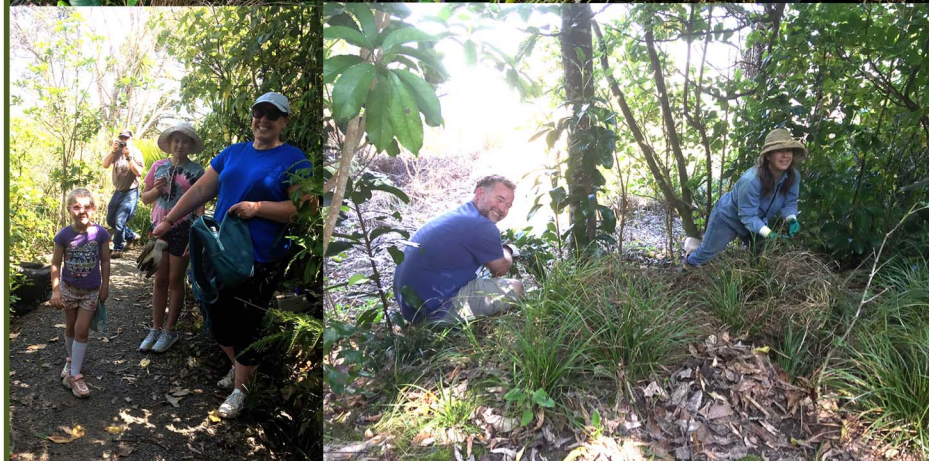
Eastview Baptist Church 21 October 2023