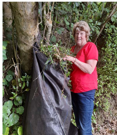
A local walker helping to reduce the weed population in the Mangemangeroa Reserve.

With the wet winter and now warm spring, weeds are thriving in the Mangemangeroa Reserve. To help control the tradescantia (Wandering Willy) two sites have been set up to encourage the public to help with this control. Collect a bag at the first station, fill it, then empty it into the big black bag at the next station, hang your bag up ready for the next person going the other way. The big black bags are special weed bags in which the weeds decay over time and can then be emptied as compost into the reserve. Every little bit helps!