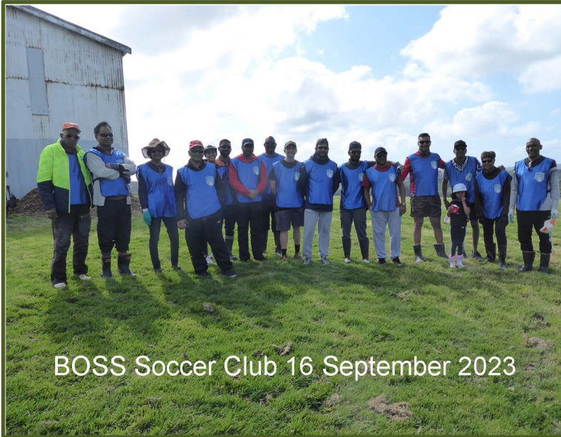
BOSS Soccer Club 16 September 2023