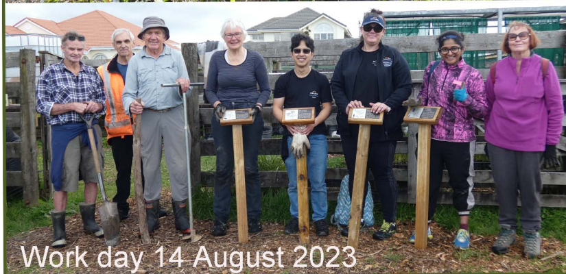
Work day 14 August 2023