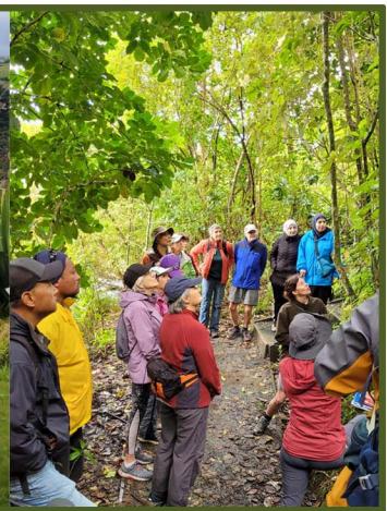
Auckland Council Ranger Walk 23 September 2023