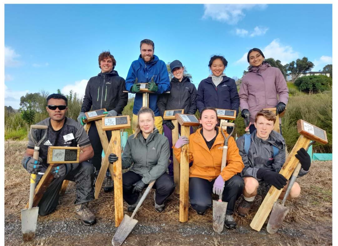
RYLA Planting Day 30 June