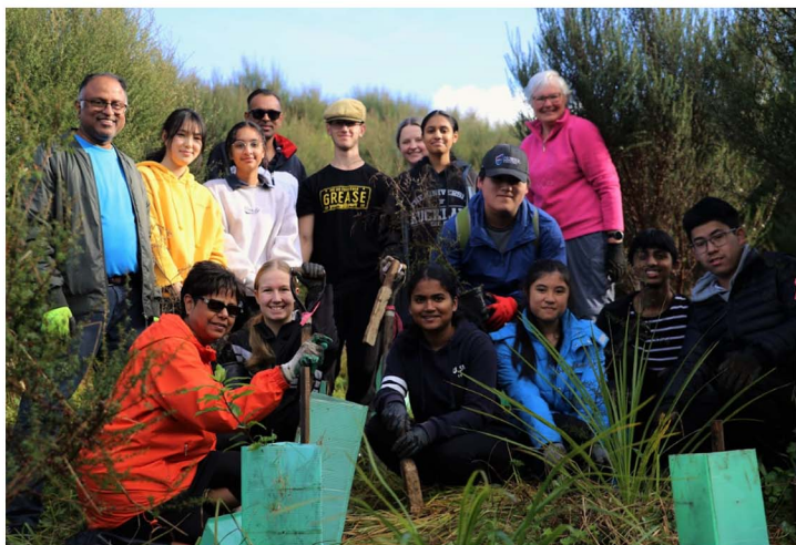
Howick College Planting Day 18 June

Six to seven hundred trees to be planted by 18 volunteers within two hours was a tall order, and it's no surprise that we did not quite make it. Luckily a group from Howick College, scheduled by the Friends of Mangemangeroa to turn up the next day, was able to finish the job. Areas planted were on the upper part of Gully L and alongside the main track dropping down below the barn. A huge amount of personal time and effort by a number of growers had gone into raising 300-400 plants from our local forest duff, along with 350 manuka. Species ranged from kahikatea, totara, puriri and karaka to putaputaweta and karamu. Murray and Kevin did the tough site prep. Thanks go to Council's contractors helping with handling the plants on the Friday. They were impressed by their wide variety and high quality. We are grateful for help given by several members of the Friends of Mangemageroa and the Council Ranger. Everyone enjoyed the fresh baking supplied by Rogan Falla with an extra bonus of cream and jam.