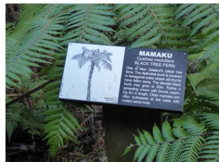
The generous donation from Workday is being used to replace identification signs in the reserve.