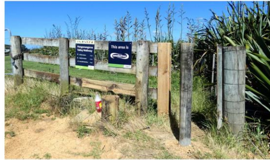
Auckland Council Facilities Team for alteration to make easy access at the stile opposite Jane Eyre Place