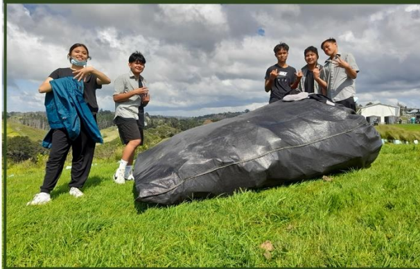
Orminston Junior College 21 September 2022