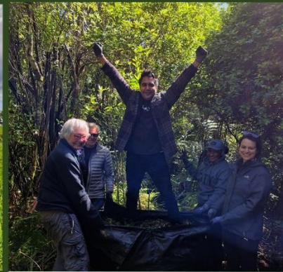
Auckland System Motorway Alliance 19 October 2022