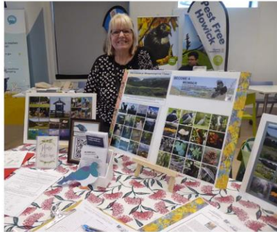
Botany Library for their Expo Day 5 November