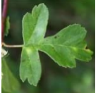
Hawthorn Crataegus monogyna