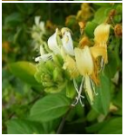
Japanese honeysuckle Lonicera japonica