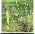
Gorse Ulex europaeus