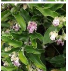
Mothplant Araujia hortorum