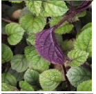
Plectranthus Plectranthus ciliatus