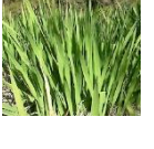
Watsonia Watsonia meriana 'Bulbillifera'