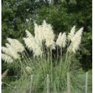
Pampas Cortaderia selloana