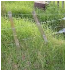
Kikuyu Cenchrus clandestinus