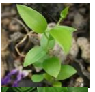
Smilax Asparagus asparagoides