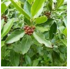
Buckthorn Rhamnus alaternus