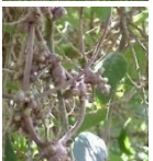
Mignonette vine Anredera cordifolia