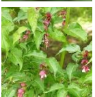
Himalayan honeysuckle Leycesteria formosa