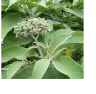
Woolly nightshade Solanum mauritianum