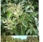
Tree privet Ligustrum lucidum