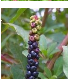
Inkweed Phytolacca octandra