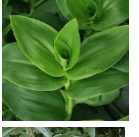
Tradescantia Tradescantia fluminensis