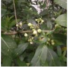
Queen of the night Cestrum nocturnum