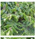
Wild ginger Hedychium gardnerianum